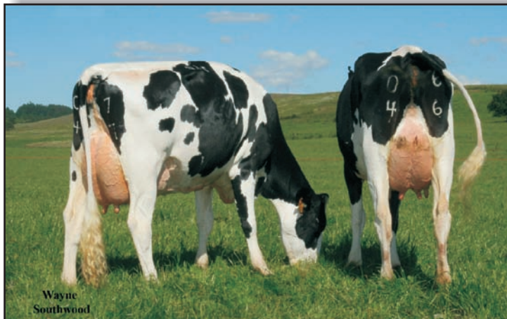
Two daughters at Pete Clowes