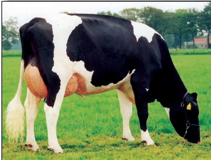
Etazon Annecy, great granddam of Jax